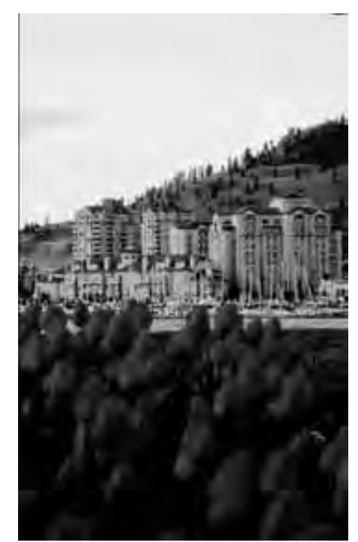
L'hôtel "The Great Okanagan Lakefront & Resort Conference Centre"

42<sup>ième</sup> Congrès annuel de la Société canadienne de météorologie et d'océanographie du 25 au 29 mai 2008 à Kelowna, Colombie-Britannique, Canada <u>http://www.cmos2008.ca</u>