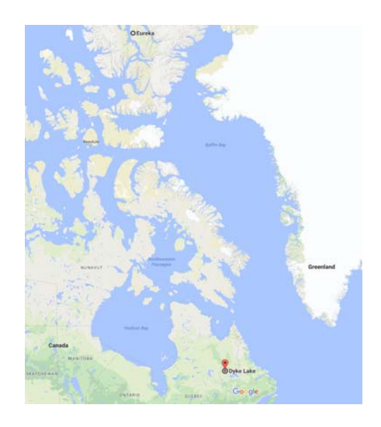
Path of aircraft flying from Eureka, Resolute enroute to Goose Bay December 24, 1947