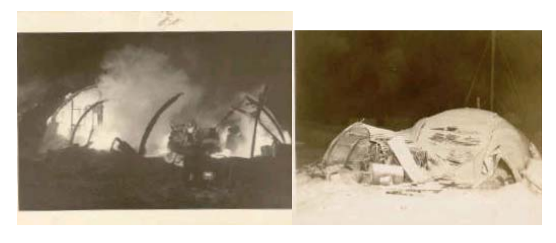
The Eureka station fire: December 25, 1948

December 26 [1948]: Communications with Resolute continue unbroken. The small SCR 694 performs admirably with its hand-cranked generator. We learn from Resolute tonight that only because of a fortunate incident were they saved from experiencing our plight this evening. They were fortunate in discovering a fire in their power-shed and were able to stop it before any damage was done. This is small consolation to us, however.