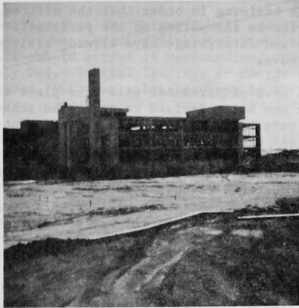
New Meteorological Headquarters Building in Progress

We have been advised, by the Department of Public Works that they will commence takeover of the new headquarters building in early June. This takeover will commence with inspections and the detailing of any defects or deficiencies where the contractor has not lived up to the terms of the contract or has not followed the drawings or specifications provided to him. Assuming that deficiencies or changes in the requirements are minor, Public Works will accept the building on the basis that the deficiencies will be remedied.