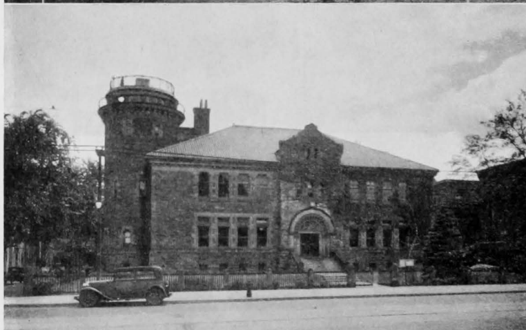
Upper: The Toronto Observatory 1854-1907, and Headquarters, Meteorological Service 1872-1907. Lower: Headquarters, Meteorological Service since 1909.