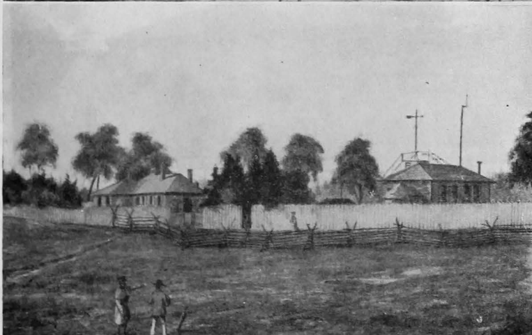
Upper: Old Fort York (the temporary quarters of the Magnetic Observatory were located on the grounds of Old Fort York, in one of the buildings on the left).