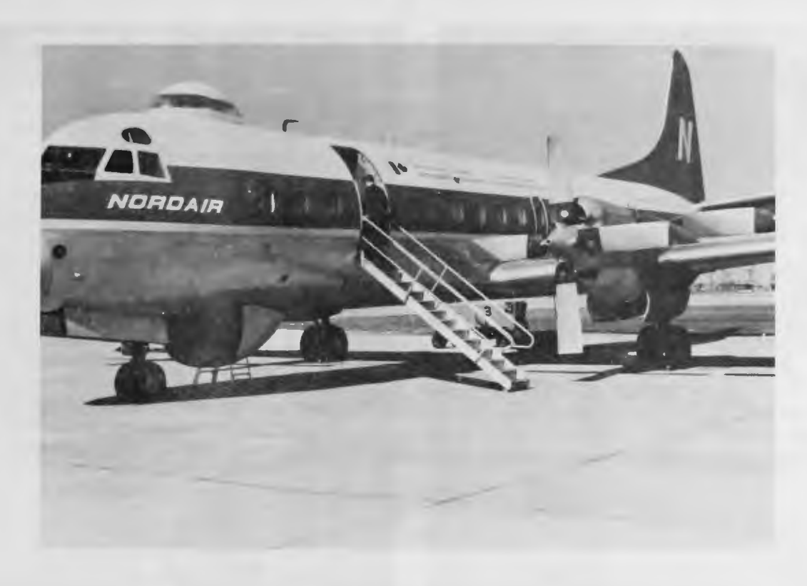
CF-NAY at CFB, Downsview.