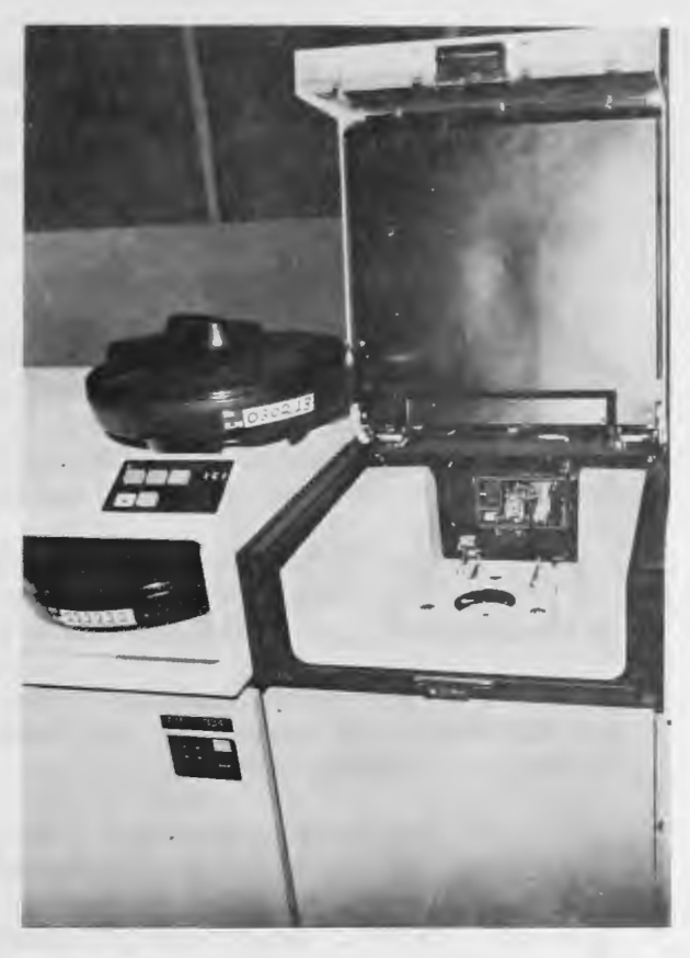
The IBM 370/135 is four to seven times faster than older models, with less than one-twelfth of the cost increase.