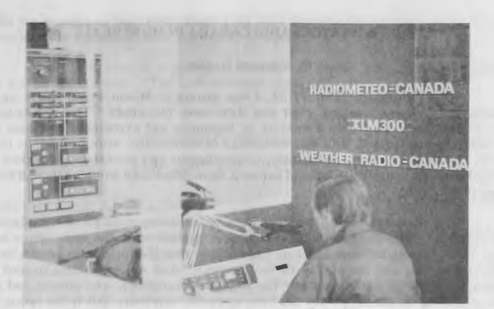
The studio is glassed in to enable visitors to watch recordings being made. Un studio vitré permet aux visiteurs de voir effectuer les enregistrements.