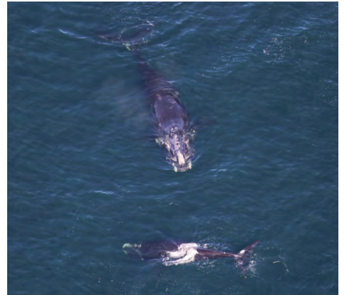
Endangered right whale mother-calf pair sighted in the Gulf of St. Lawrence in 2015. Right whale distributions appear to be changing and my research helps to find out if changes in food supply and ocean climate may explain the shift.

To advance the science on these issues. I focus on a fascinating predator-prey system in the North Atlantic; that of the endangered North Atlantic right whale and its main food, lipid-producing copepods of the genus Calanus . Right whales are specialist feeders on a particular life stage of Calanus that provides the high energy that right whales need through its unique physiology and life history strategy. Calanus spend their spring and early summer feeding and accumulating lipid-stores These lipids make Calanus inside their bodies. particularly energy rich and appetizing to right whales. Around the end of summer, Calanus enter a dormancy phase of their life cycle, when they sink down into deep depths and rest over the entire winter. On the continental shelf off Atlantic Canada, sinking Calanus accumulate in dense, vertically constricted layers near the seafloor within deep basins, particularly in the Bay of Fundy and on the western Scotian Shelf. Right whales dive up to 200 m to forage on these deep, energy-rich Calanus layers.